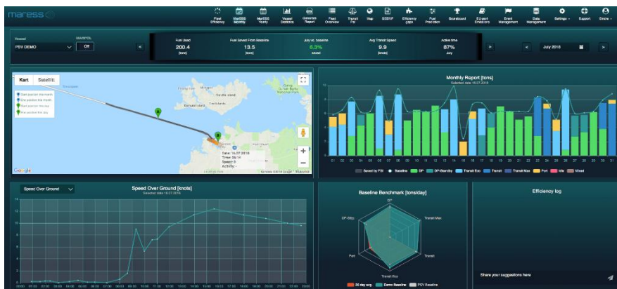
Analytics software comparing historic baseline against performance across the full range of operations of a vessel.

The power of data driven decision making needs to go hand in hand with a company culture rewarding efficient operations. The software used was designed to promote rapid learning and was achieved through close dialogue between those onboard and the development team. For both Yxney and Solstad Offshore, it is important that the software is indeed a tool for the crews, incentivising the sharing of best practices. Extraordinary results are only truly realised through the attention and well-informed efforts of the crew onboard.