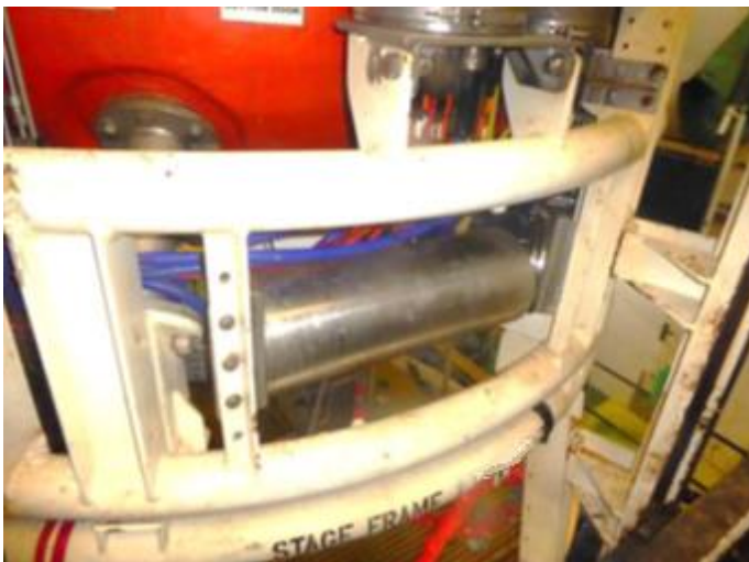
Battery pack (silver cylinder) located within the Bell Frame