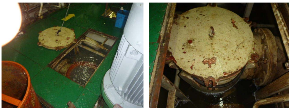
Figures: showing flooding (left) and cover plate of sea strainer (right)

A member has reported an incident in which the engine room of a seagoing vessel was flooded to a level of two metres above tank top (to just below the engine room floor plating). Had the flooding incident lasted a few minutes longer, serious machinery damage could have been the result. The incident occurred during ballasting operations, when the configuration of pumping from and to ballast tanks was altered. During this process the cover plate of the sea strainer was blown off. This resulted in seawater ingress into the engine room. Engine room personnel instructed the bridge officer in charge of ballasting to stop ballasting operations (without mentioning reasons). As per company procedure, the overboard suction valve and overboard discharge valve were opened to 'de-energize' the pumping system. This worsened the situation since a direct connection between open water and engine room was created. This was noticed by engine room personnel immediately and the bridge officer was instructed to close overboard valves. There was no damage and no injuries.