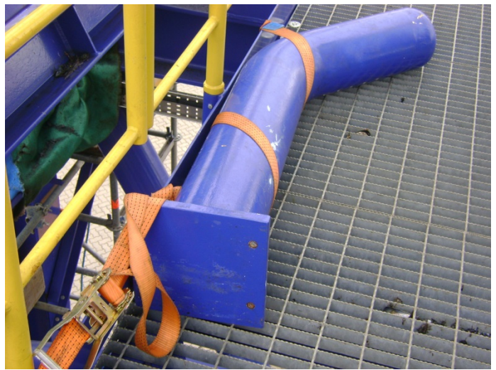
Figure 2: guide bar

Our member was made a number of modifications to the design of the horizontal lay system, in order to prevent recurrence: