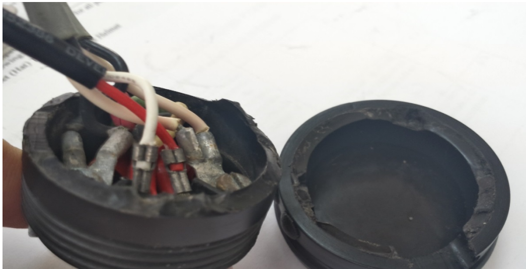
Figure: showing broken helmet communications module

Our member's investigation revealed the following: