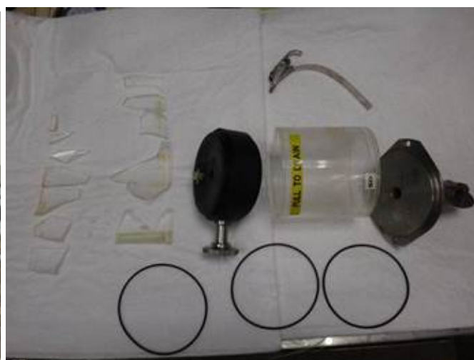
Showing reclaim before and after failure

Our members' investigation revealed the following: