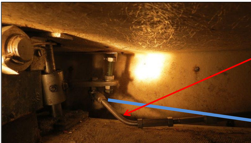
Figure 2: Showing sheared hook release mechanism from the lifeboat that dropped

This photograph shows the release hook mechanism linkage at the forward locking mechanism.