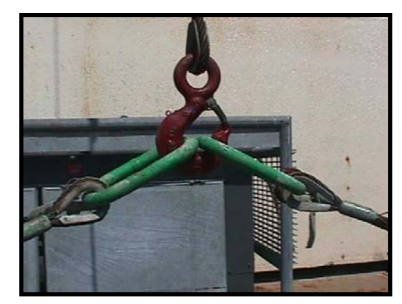
Figure 2: Similar hook point with incorrect sling angle=hazard.

he company concerned has initiated the following corrective actions: