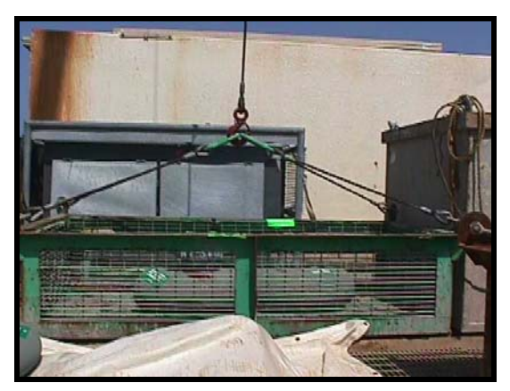
Figure 1: Similar cargo basket with incorrect sling angle.

The crane operator failed to observe the rigging techniques prior to starting the lift.