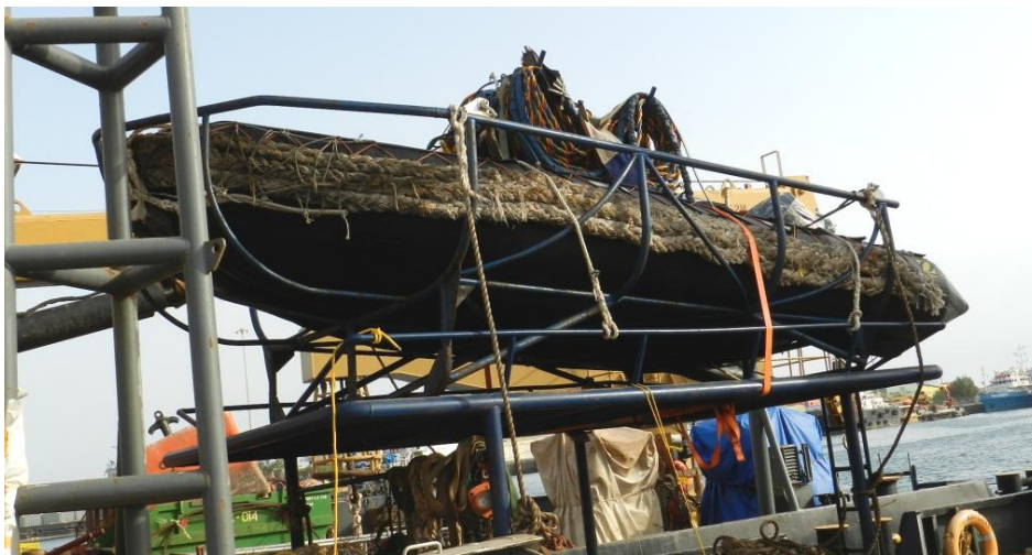
Figure: Showing inflatable boat on stand after reconstruction