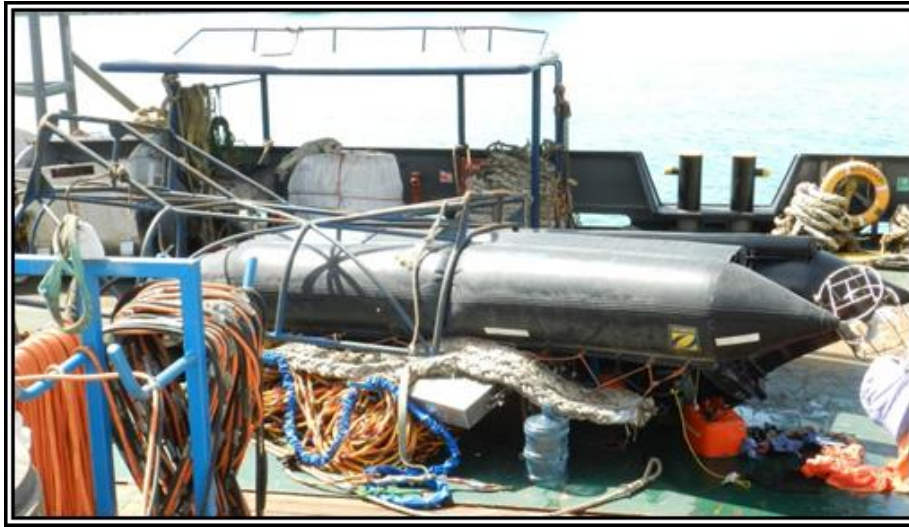
Figure: Showing zodiac inflatable boat after collapse of stand

There were no injuries and no environmental damage. The small boat sustained some damage.