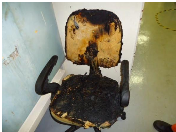
Figure: Fire-damaged chair after the event

A member has reported an incident in which a small fire was caused by hot work taking place on the deck above. The incident occurred when a repair was being performed by a sub-contractor on a steel plate in the forecandle area. The job involved using an oxy-acetylene torch to remove an old corroded plate. During this activity, the oxy-acetylene cutting of the plate caused heat transfer from the forecandle deck area to the store-man's office area (located directly below the place where the hot work was being carried out). As a result, glowing slag fell on the store-man's chair, which caught fire. There was no-one in the storeman's office at the time. The fire detection equipment in the office caused the alarm to go off. There were no injuries.