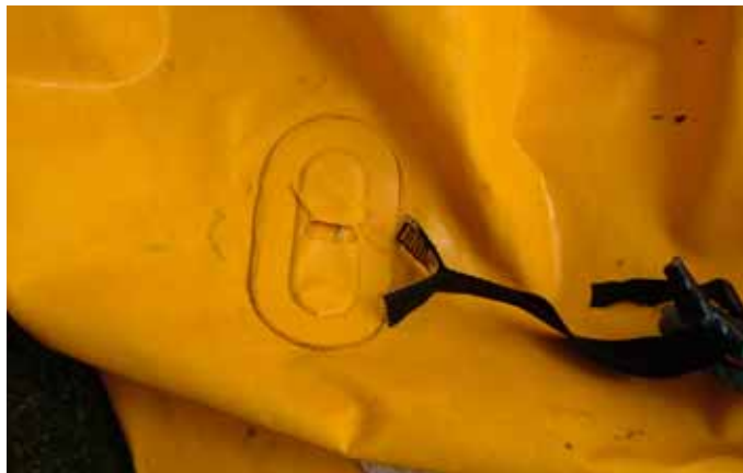
Handling loop attachment point failure

The inverter line was attached to one of the handling loops on the top of the bag. When the lift bag was required to be deflated, the bag dump valve was unable to be operated, leaving the lift bag inflated. The decision was taken to cut the rigging attaching the bag to the load in an attempt to invert the bag using the inverter line. When the rigging was cut, the inverter line came under tension and the attachment point (handling loop) on top of the bag failed. This allowed the lift bag to freely ascend to the surface.