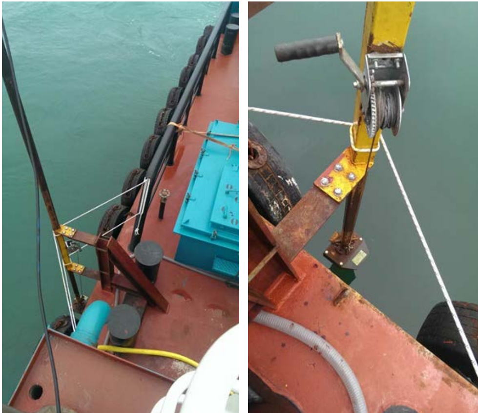
Photographs showing pole and winch

A member has reported an incident in which a crewman was struck and injured by an out-of-control rotating handle. The incident occurred on a small vessel during the deployment of a stand-alone echosounder. This required the use of an over the side pole to deploy the echo sounder. The crewman was lowering the echosounder pole by means of a small winch when the handle slipped from his grasp and started to rotate quickly. As he tried to grab the handle to regain control over the winch, the edge of the handle struck his forearm causing a deep cut which subsequently required seven stitches.