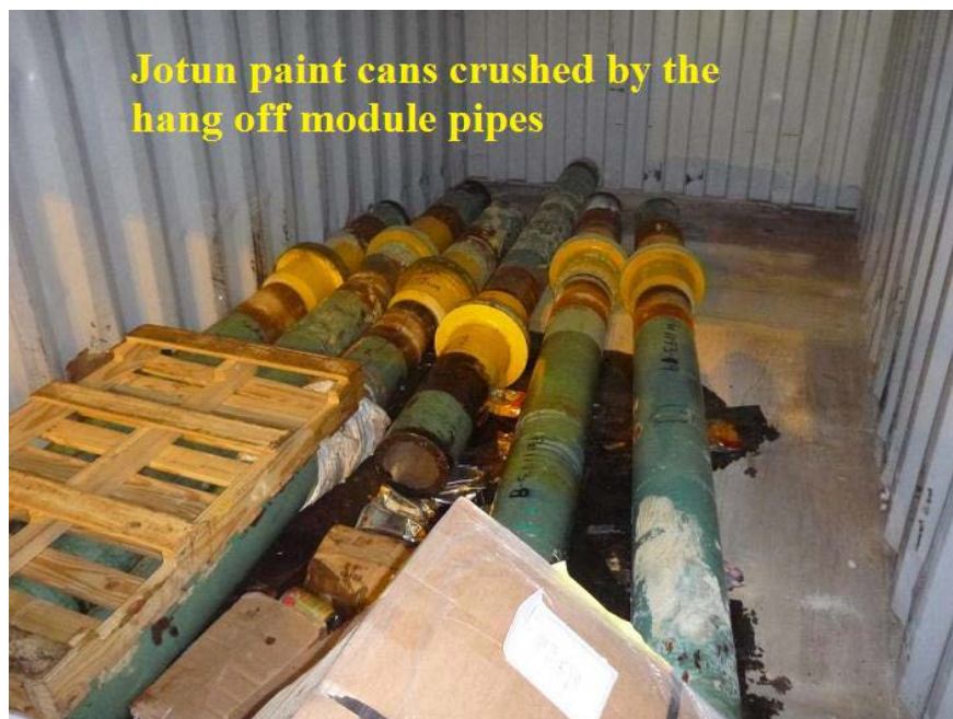
Photograph: showing inside of freight container and damaged cargo.

A member has reported an incident in which a freight container was delivered offshore with damaged internal contents, owing to poor stowage. When the doors of the container were opened, there was a strong smell of paint. It was discovered that heavy pipes had been loaded into the container but had not been stowed properly or lashed down. The pipes had moved during transit and had crushed part of the other cargo, including a number of cans of paint and some welding consumables.